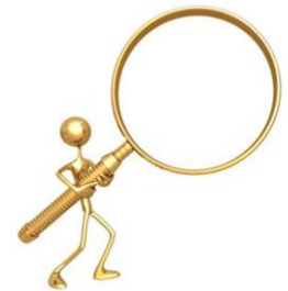
Quality improvement and cost reduction are compatible, but it requires that we do not leave things to chance