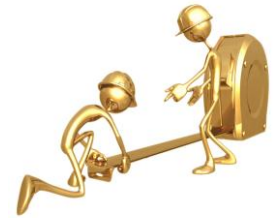
Measuring and reporting cost of non-quality will create awareness

If you need help to identify and reduce your cost of non-quality or with the implementation of Visual Management systems, contact Adapt To Change and start improving your bottom line profits today!